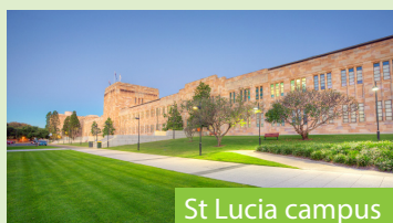
St Lucia campus